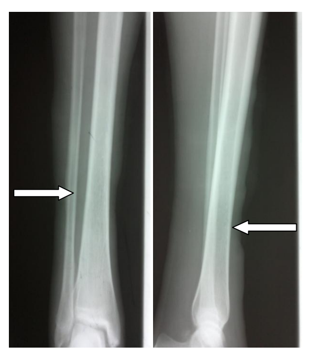
Figure 1: Plain x-ray of the right lower limb (AP and lateral view) showing soft tissue irregularity and defect (white arrows) in the lateral aspect lower third of the right leg.

B mode sonogram study of the limb demonstrated a fistulous connection between the right femoral artery and right femoral vein in the middle third of the right thigh (Figure 2). Mosaic colour flow pattern was noted in this region with colour Doppler (Figure 3).