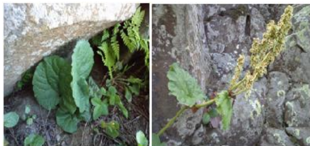
Figure 1: Rheum webbianum -Royle in natural habitat

species. The significance of an efficient in vitro protocol would be to obtain maximum number of plantlets in minimum period of time. Their restoration in the natural habitat will subsequently help in conserving the biodiversity. The present study was carried out to develop a conservation protocol Rheum webbianum .